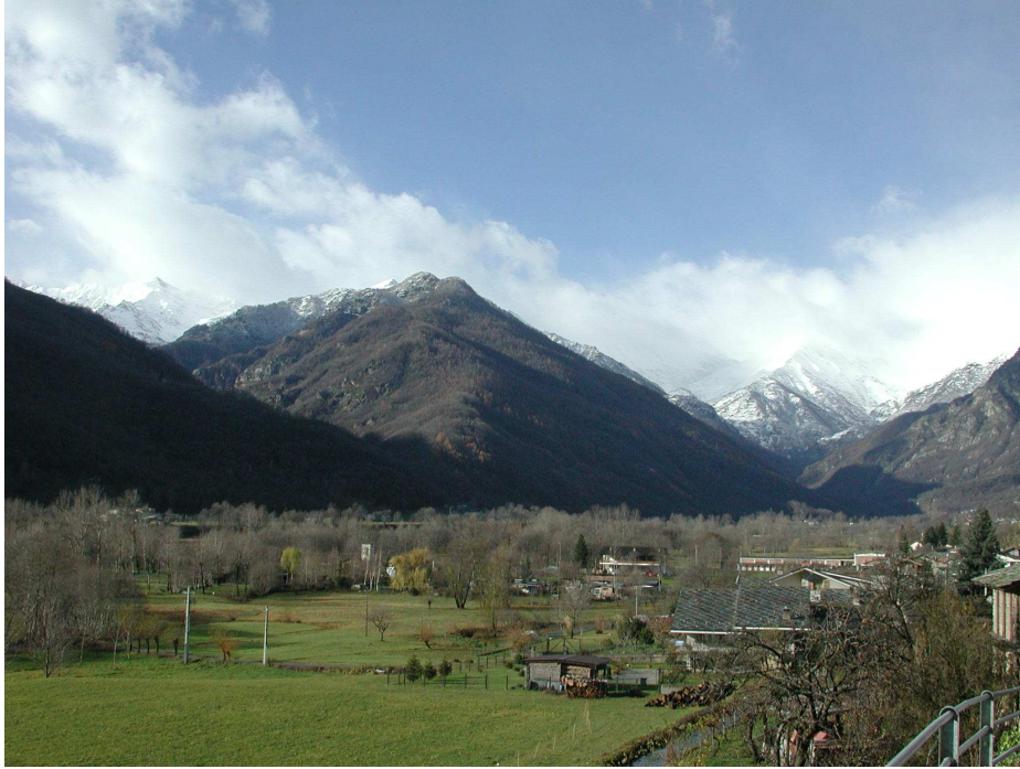
Figure 1: Val Pellice valley